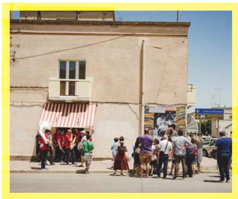
Cucine(s) Floriane Facchini & Cie (Italy) Matera European Capital of Culture, Matera Italy - 2019