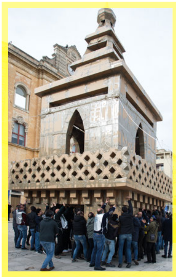
Monumental constructions Olivier Grossetête (France)

Matera European Capital of Culture, Matera Italy - 2019